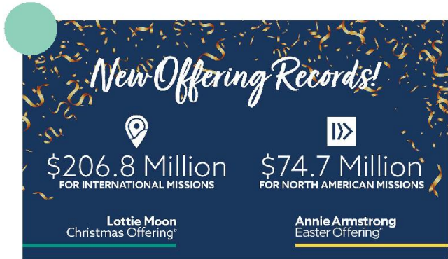
Annie Armstrong Easter Offering and Lottie Moon Christmas Offering records!