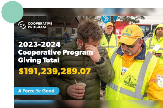
National Cooperative Program (CP) giving tops $191 Million (Source: baptistpress.com)